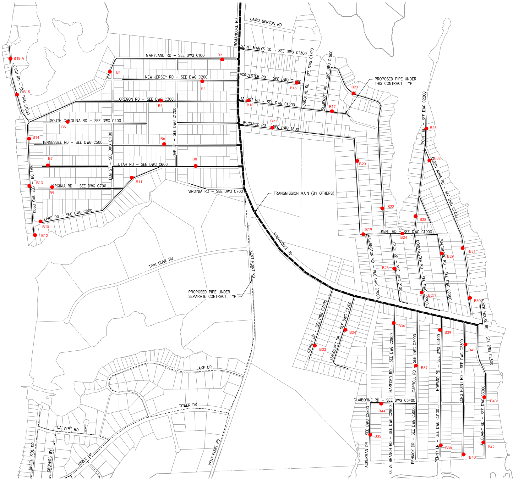
OVERALL KEY MAP